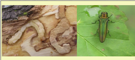
Picture 2. Emerald Ash Borer Larva in Gallery and Adult

In an effort to find a solution to protect high value ash trees from damage by EAB, the potential of TreeAzin was assessed by determination of: